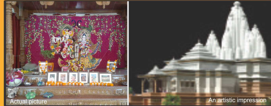
ANSAL ISKCON Spiritual Centre (Operational)