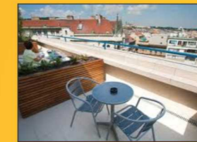
Private balconies in each apartment