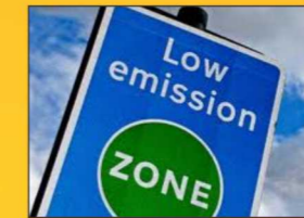
Low pollution level