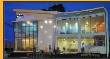
MAPLE TOWN & COUNTRY CLUB