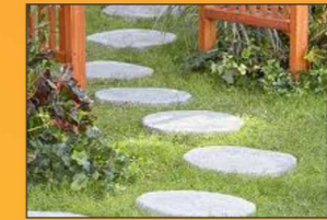
Well spread out walkways

Apartment designed with optimum space management