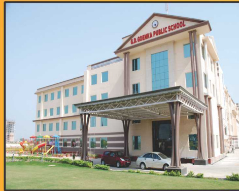
G.D. Goenka Public School Academic session started