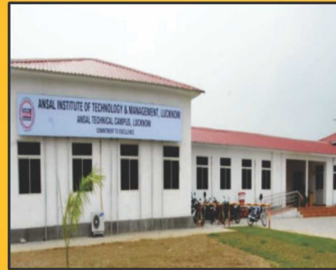
Ansal Institute of Technology & Management (AITM) (Operational)