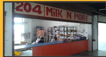
MILK AND MORE