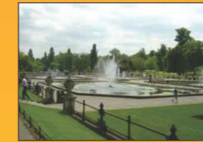
Ample open areas