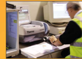
Absolutely secure with regulated entry and exit points