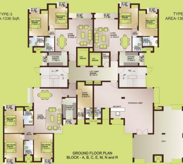
GROUND FLOOR PLAN BLOCK - A, B, C, E, M, N and R