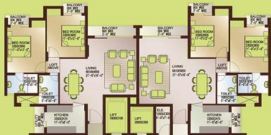
TYPE-4 AREA-1360 Sqft.