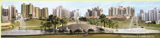
Grand entrance of Sushant Golf City