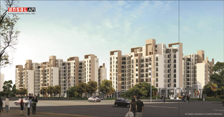
An artistic impression of Celebrity Meadows