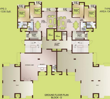
GROUND FLOOR PLAN BLOCK - D