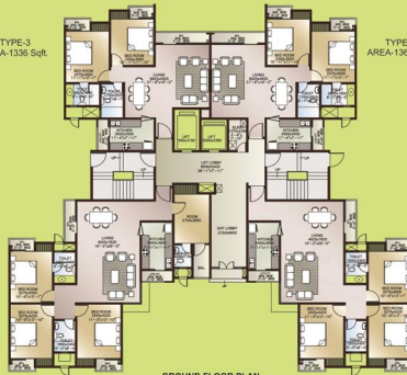
GROUND FLOOR PLAN BLOCK - G, H, L, Q