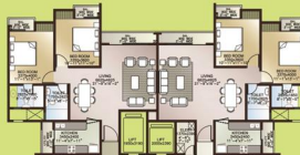
TYPE-4 AREA-1360 Sqft.