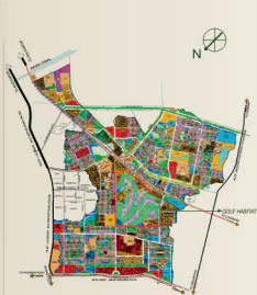
SUSHANT GOLF CITY