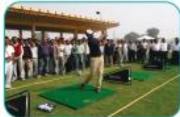
Golf Academy Operational

Sushant Jeevan Enclave Premium 2 & 3 Bedroom Apartments