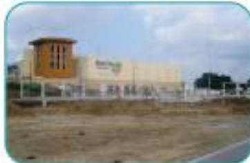
Best Price - A Bharti Walmart Venture