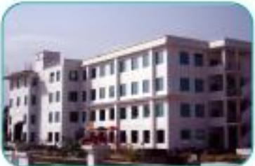
G.D. Goenka Public School