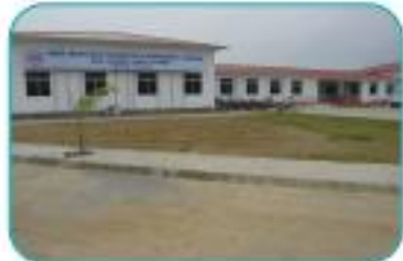
Ansal Institute of Technology & Management