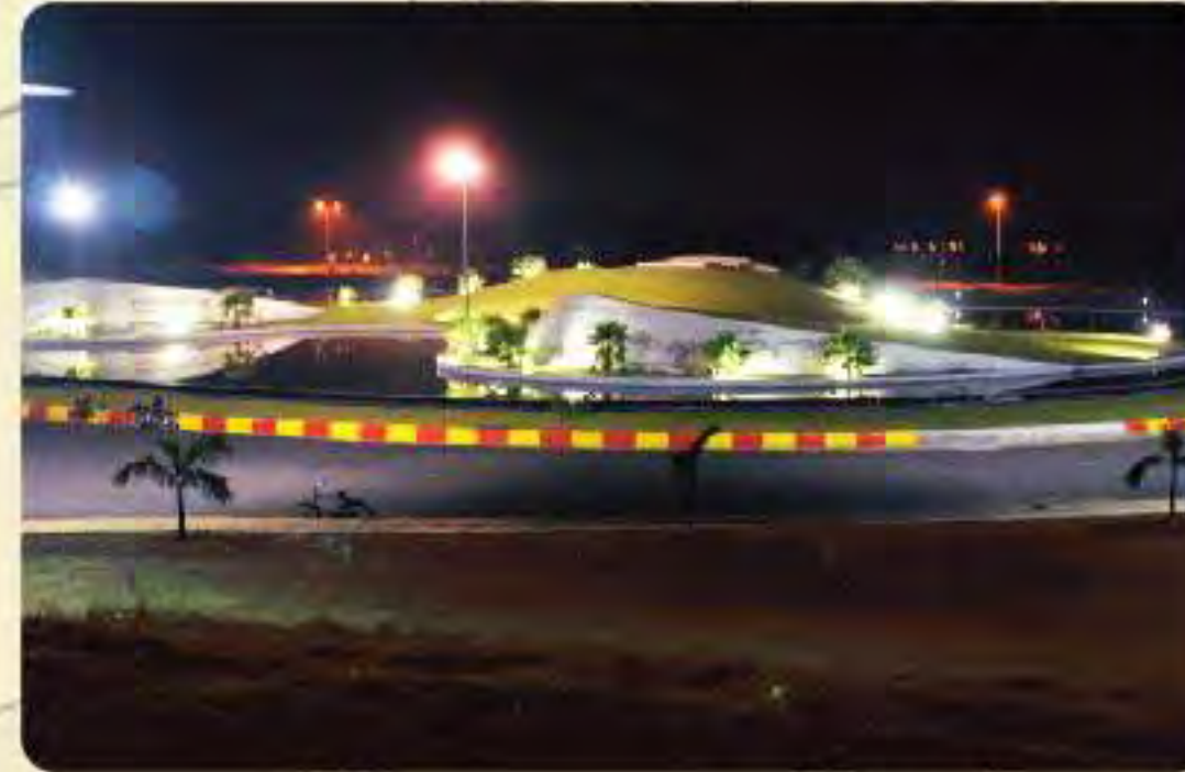
Actual entrance picture

Today, as a flagship project amongst a host of nationwide projects, Ansal API is building a hi-tech city in Lucknow, spread across 3530 acres and expandable to 6000 acres - Sushant Golf City.