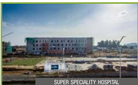
SUPER SPECIALITY HOSPITAL

Cancer hospital in the city would come up over an area of about 50 acres along the Chak Gajaria farm on Sultanpur Road adjacent to Ansal API SUSHANT GOLF CITY .