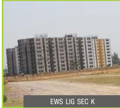
EWS LIG SEC K