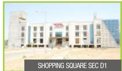
SHOPPING SQUARE SEC D1