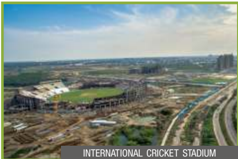
INTERNATIONAL CRICKET STADIUM

The project is estimated to provide direct jobs to nearly 25,000 people with indirect employment to 50,000 .