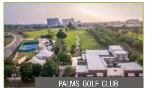
PALMS GOLF CLUB