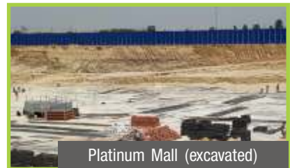
Platinum Mall (excavated)