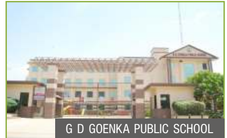
G D GOENKA PUBLIC SCHOOL