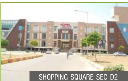
SHOPPING SQUARE SEC D2