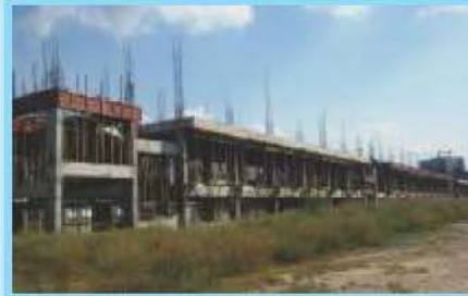
Shopping Square Sec-A