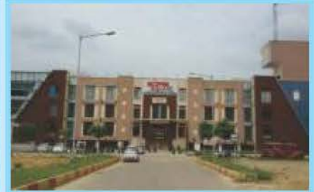
Shopping Square Sec-D, SS-II