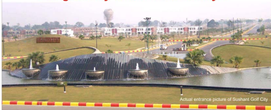
Actual entrance picture of Sushant Golf City