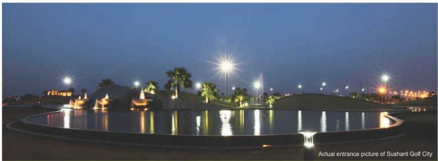
Actual entrance picture of Sushant Golf City