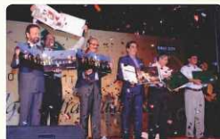
Golf Villa Brochure Unveiling