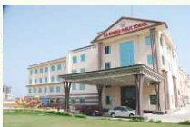
G.D. Goenka Public School