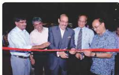
Golf Villa Unveiling