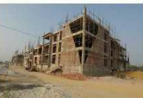
Shopping Square Sec-D