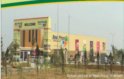
Actual picture of Best Price-Walmart.