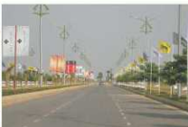
Wide Metalled Roads