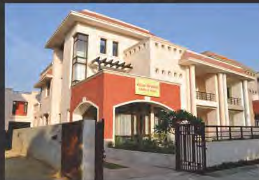
Palm Spring Villa