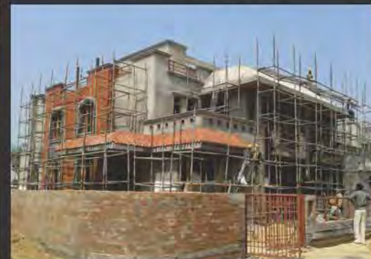
Palm Grove Villa