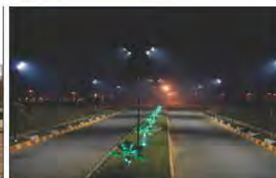
Well constructed roads