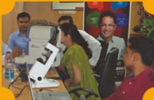
Eye Checkup Camp Apr 7th, 2014