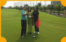
Kite Flying Competition Aug 15th, 2013