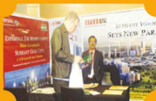
London Expo June 2nd & 3rd, 2013