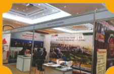
The Times of India Realty India Expo, Bahrain - Dec 20th & 21st, 2013