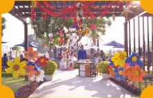
Hawaiian Sundown Party Dec 29th, 2013