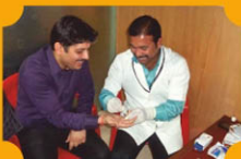
Health Camp in City Office Nov 26th, 2013