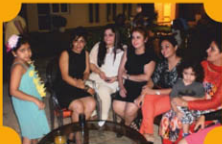
Go Goa Party Aug 10th, 2013