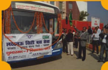
City Bus Service Launched Dec 2nd, 2013