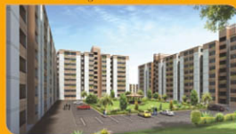
भरोश - जल्प आव कर्न के लिए भवन