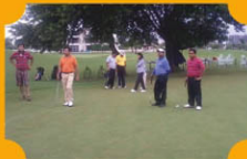
Putting Competition Aug 18th, 2013