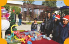
Xmas Brunch Dec 25th, 2013