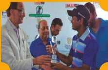
Professional Golf Tour of India Oct 14th - 17th, 2013