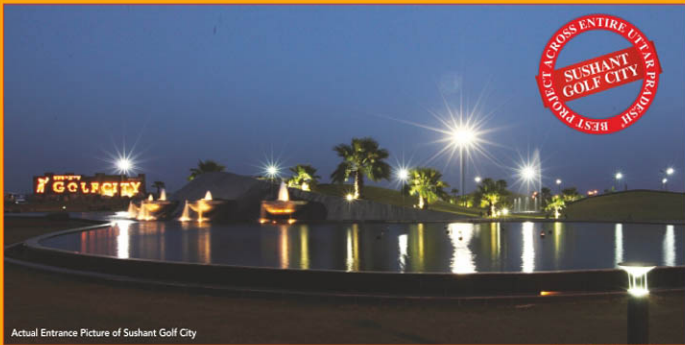
Actual Entrance Picture of Sushant Golf City