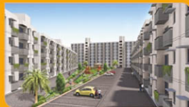
आशरा - दुर्लभ आव कर्न के लिए भवन