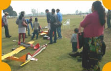
Aero Modeling Show Jan 12th, 2014