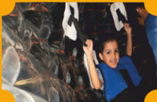
Kids Zorbing Mania Aug 24th, 2013