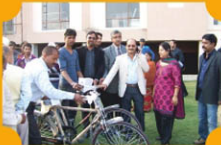
Cycle Distribution to Workers Dec 3rd, 2013