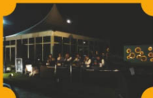
Sufi Night Sept 21st, 2013