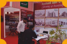
Lucknow Mahotsav Nov 22nd till Dec 2nd, 2013