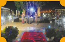
Bollywood Night Sep 7th, 2013