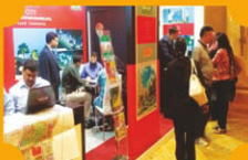
India Property Fest, Abu Dhabi Sep 6th & 7th, 2013