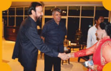
Golf Annexe Opening May 31st, 2013