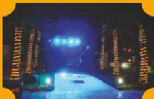
Laser Show Nov 1st, 2013